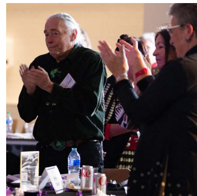
Missoula, MT Star Party attendees.

Please join our community of supporters for the 2024 STAR Party. Your sponsorship will directly benefit women who are determined to transform their lives through education and earn a better life for themselves and their families. Thank you for your consideration! We look forward to customizing a meaningful package for your 2024 giving goals.