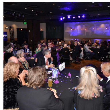
Athens, GA attendees, 2023 STAR Party.

The hybrid format of the STAR Party provides exposure to a diverse national audience. Our 2023 event was held in-person in four locations: Athens and Atlanta, Georgia; Jersey City, New Jersey; and Missoula, Montana. Virtual attendees streamed the live event from their homes around the country. A total of 475 people joined the celebration in-person or online.